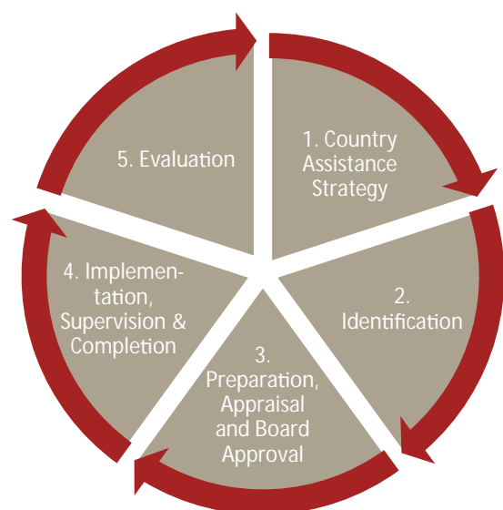
Figure 1: The World Bank Project Cycle

Figure 1 summarizes the main steps of a standard World Bank project. Table 2 identifies a series of actions that can be taken by World Bank staff, clients and development partners within existing processes of the project cycle.